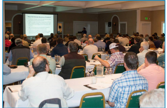
2014 nitrogen management training session.