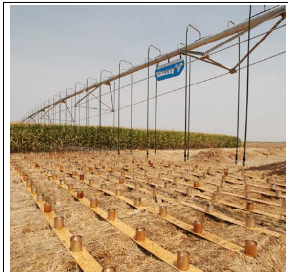
Figure 1: Catch-can uniformity determinations under overhead linear move irrigation system at UC WSREC, Five Points, CA

We determined the relative amounts of soil evaporation following wetting to field